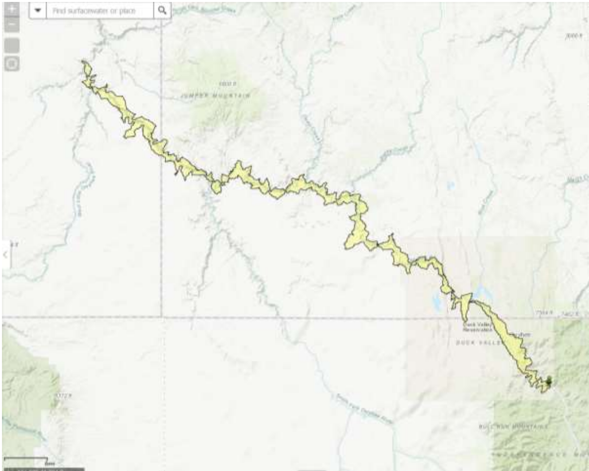
Figure 2. Duck Valley Reservation watershed downloaded from EPA Waters GeoViewer, Drainage Area Delineation feature.