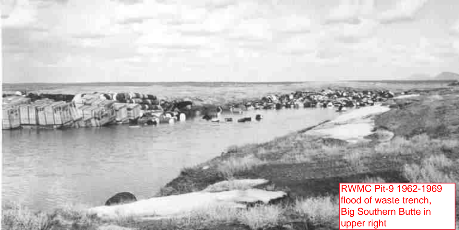
RWMC Pit-9 1962-1969 flood of waste trench, Big Southern Butte in upper right