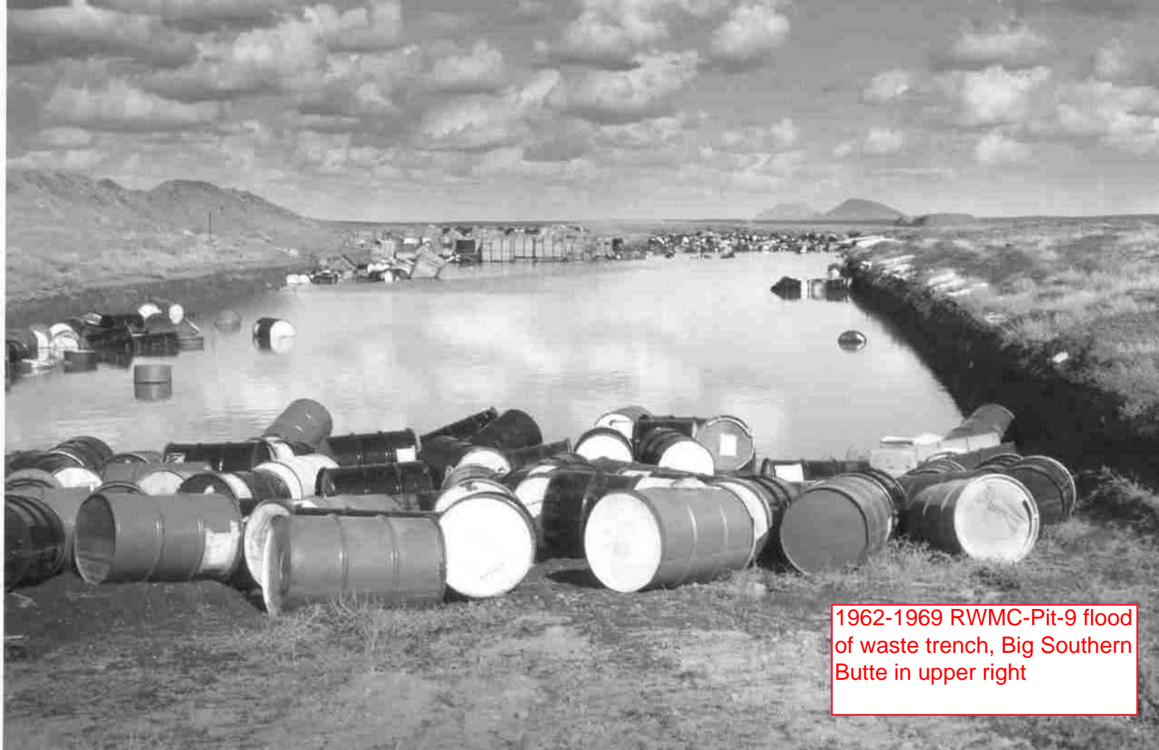
1962-1969 RWMC-Pit-9 flood of waste trench, Big Southern Butte in upper right