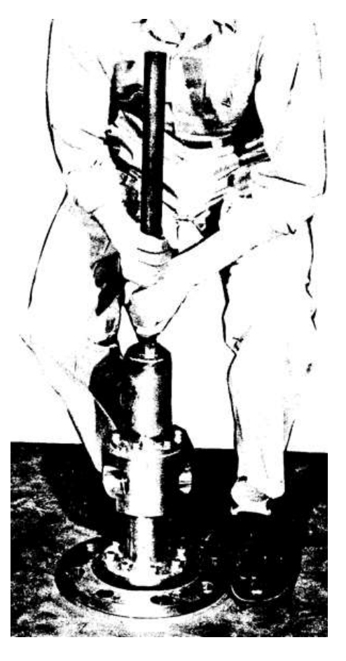
Figure 3 . Mock-up of manual rod lift from IDO-19300.